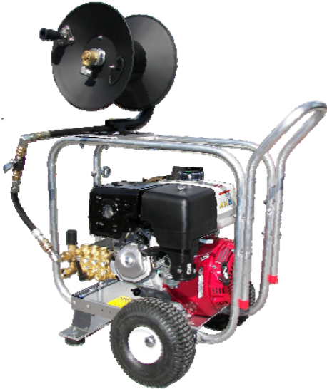
JBS 4040HG Micro-Jetter