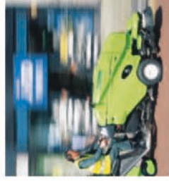
Travel at 10 mph