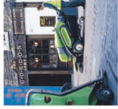
Converts to Walk-Behind