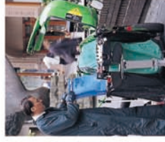
Easy to Empty